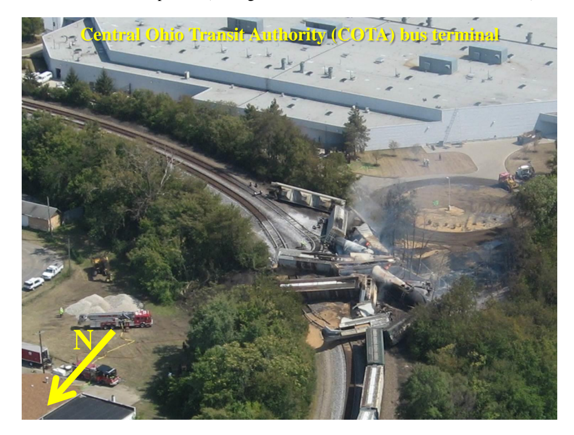
Figure 1. Aerial photograph of the derailment.

car fueled a large pool fire. The two other tank cars that were carrying denatured ethanol were engulfed in the pool fire and split open. Witnesses observed multiple energetic fire eruptions when these two tank cars ruptured. (See figure 1 for an overview of the accident scene.)